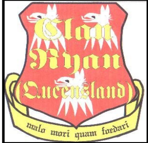
Foundation Branch Logo